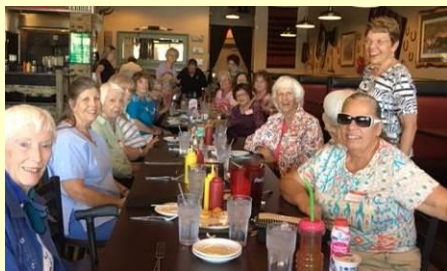
Fun luncheon out