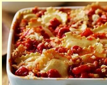
Four Cheese Ravioli

Caramelize onion in small amount of olive oil in a large skillet. Add ground beef and brown. Drain grease. Add spaghetti sauce, diced tomatoes and Parmesan cheese and mix thoroughly. Cook ravioli according to package directions, and drain. In a 9 x 13 pan add a bit of the sauce to the bottom of the pan. Add a layer of ravioli, a layer of the sauce, then another layer of ravioli, finishing with the sauce. Top with the shredded mozzarella. Cover with foil. Bake at 350 degrees for 1 hour or until brown on top. ~ Louise Glaysher