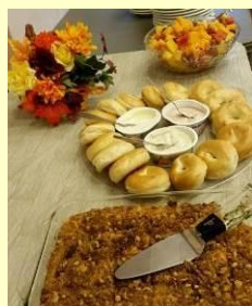
Wonderful friends and food