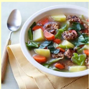
Hearty Fall Soup

1/2 head of cabbage, chopped 6 cups chicken stock 3 medium potatoes, diced 1 medium onion, chopped 2 medium carrots, diced 3 cloves garlic, diced 1 lb. Polish Kielbasa sausage, sliced 1/4 inch thick 1 - 15 oz. can of white beans or pinto beans, drained 1 - 14 1/2 oz. can diced tomatoes and green chili peppers