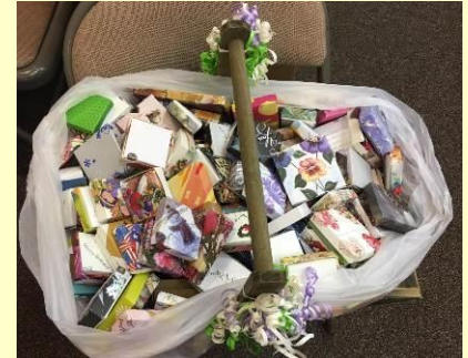
M&M Jewelry boxes for the Flea Market