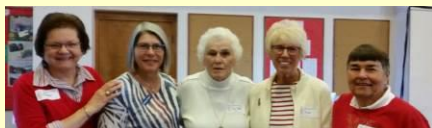
Having fun at the February UMW Meeting