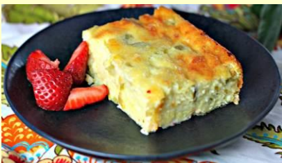
Green Chili Egg Casserole

No, in all these things we have complete victory through Him who loved us! For I am certain that nothing can separate us from His love: neither death nor life, neither angels nor other heavenly rulers or powers, neither the present nor the future, neither the world above nor the world below—there is nothing in all creation that will ever be able to separate us from the love of God which is ours through Christ Jesus our Lord. Romans 8:31-39