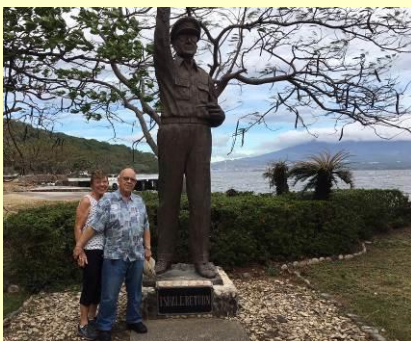
Fun in the Philippines