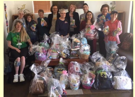
M&M Circle with Easter Baskets

If you have any questions about UMW, its meetings and activities, please contact one of the UMW Board Members: