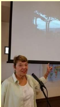
Presenting the Philippines