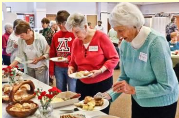
Great Food and Great Friends are found at UMW meetings

Remember - M&M Tutoring is 3:00 p.m. Monday and Tuesday each week that school is in session.