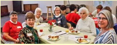
More fun at the UMW Meeting

My friends, consider yourselves fortunate when all kinds of trials come your way, for you know that when your faith succeeds in facing such trials, the result is the ability to endure. Make sure that your endurance carries you all the way without failing, so that you may be perfect and complete, lacking nothing.