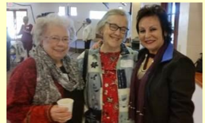
Friends at the UMW meeting

The angel spoke to the women. "You must not be afraid," he said. "I know you are looking for Jesus, who was crucified. He is not here; he has been raised, just as he said. Come here and see the place where he was lying. Go quickly now, and tell his disciples, 'He has been raised from death, and now he is going to Galilee ahead of you; there you will see him!' Remember what I have told you." Matthew 28:5-7