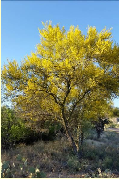
Spring in Tucson

The kind of fasting I want is this: Remove the chains of oppression and the yoke of injustice, and let the oppressed go free. Share your food with the hungry and open your homes to the homeless poor. Give clothes to those who have nothing to wear, and do not refuse to help your own relatives. Isaiah 5:6-7