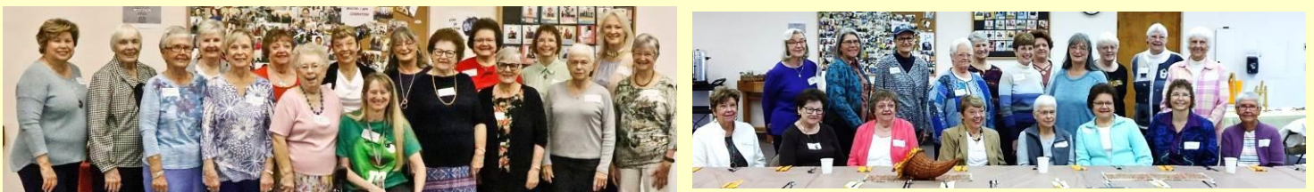
DSUMC UMW members from two different meetings