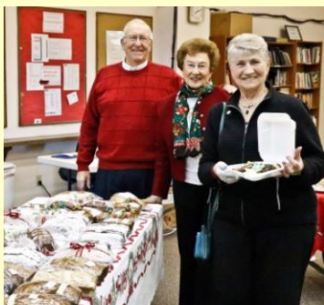
Finding Wonderful Christmas Cookies and Breads