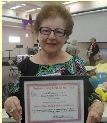
2013 DSUMC UMW Received the Outstanding Unit of the Year