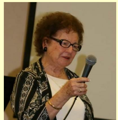
Handing over the mic to new leadership