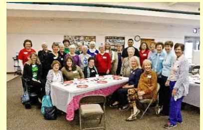
A packed UMW Meeting

They replied, "Believe in the Lord Jesus, and you will be saved—you and your household." Acts 16:31