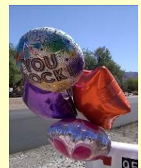
Caravan started at Desert Skies then headed to Glenda's