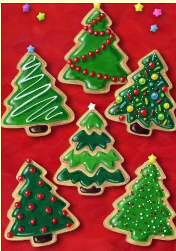
Christmas Cut-out Cookies

For to us a child is born, to us a son is given, and the government will be on his shoulders. And he will be called Wonderful Counselor, Mighty God, Everlasting Father, Prince of Peace. Of the greatness of his government and peace there will be no end. He will reign on David's throne and over his kingdom, establishing and upholding it with justice and righteousness from that time on and forever. The zeal of the Lord Almighty will accomplish this. Isaiah 9:6-7