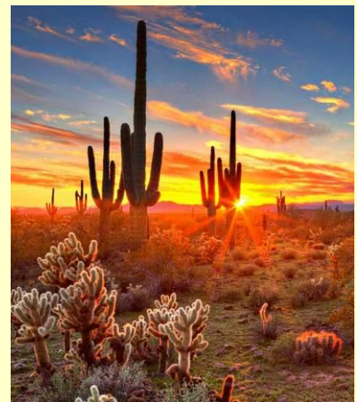
Sunrise in Tucson

God gave His greatest gift to us on that first Christmas Day and may the wonder of it always guide and light your way. Merry Christmas!